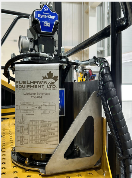
Stainless Mounting with Laser Etched Lubrication Schematic

Effortless Auto Lubrication with Bluetooth Connectivity