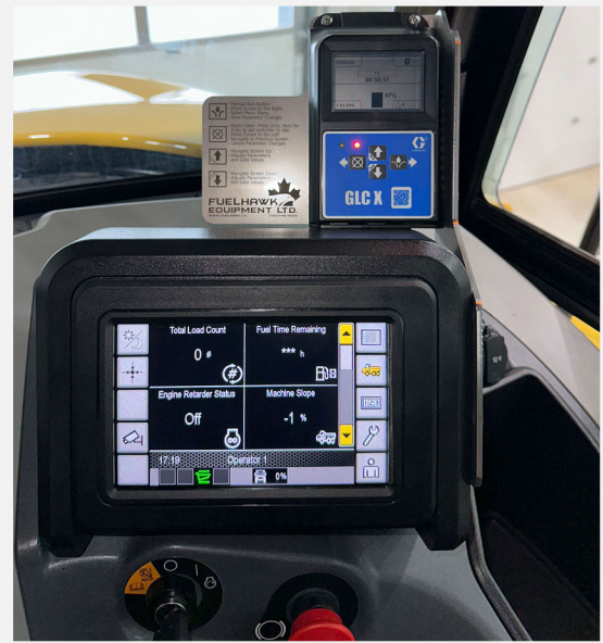
GLCX Controller Located Above Console in Cab