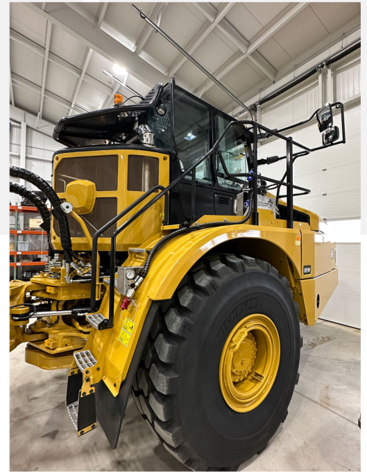
Custom Bolt on bracket designed to fit specifically on this unit