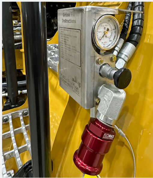
Autofill Shutoff with Laser Etched Grease Fill Instructions