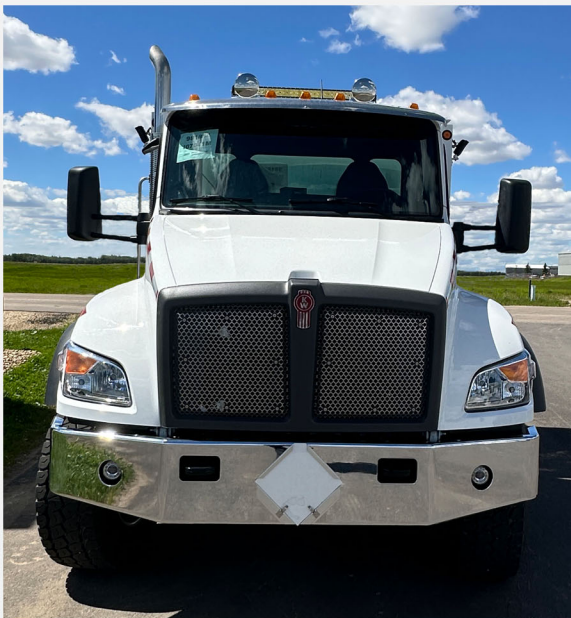
50" High Mounted Light Bar

Dispensing Systems for: Diesel Exhaust Fluid, Engine Oil, Coolant and Grease