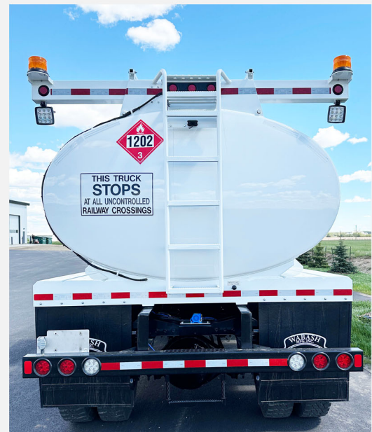
Back Camera & Hi-Vis Lights