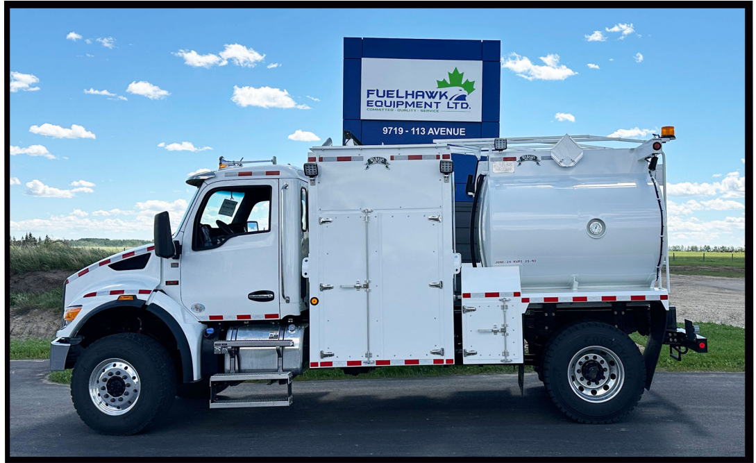
Wabash Aluminum TC406AL Tank

Titan Finch II display shows the Diesel fluid volume on hand. The lower reel is diesel fuel and is equipped with a FloMAX FNBL Nozzle.