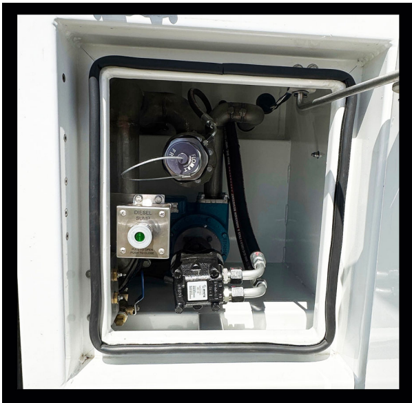
Passenger Side Diesel Fill Port Cabinet

Hypro DEF Pump, Tank includes indirect coolant heater with Hartmann remote fill coupler which is connected to a non-pressurized shutoff valve on top of the tank.