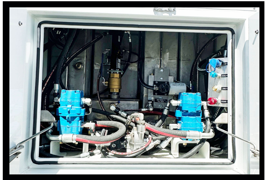
Passenger Side Fluid Fill Cabinet